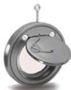
(W/ Spring) JT 300S