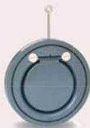
(W/O Spring) JT 300